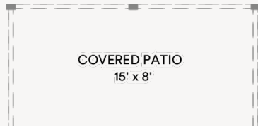
First Floor (larger scale)