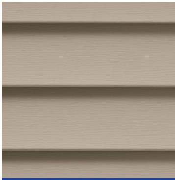
Siding: Natural Clay