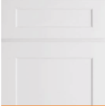
Cabinetry: Birch - White