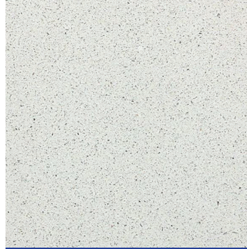
Kitchen Countertops: Quartz - Fresh Linen