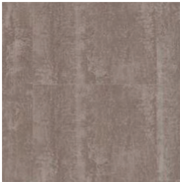
Bathroom Flooring: LVT - Quarry - Pisa