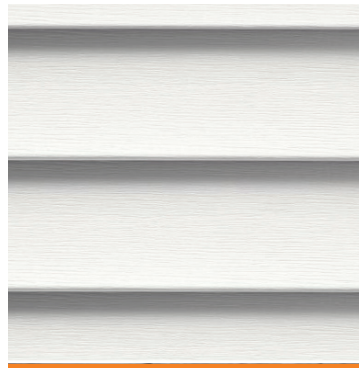
Exterior Corner Trim: White