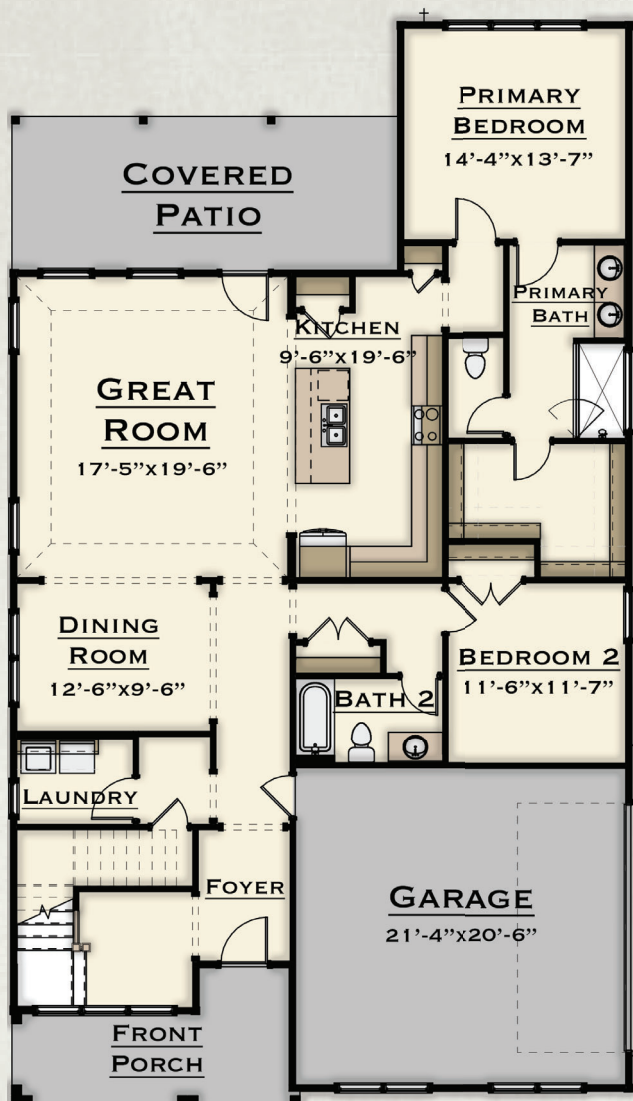
Main Level A