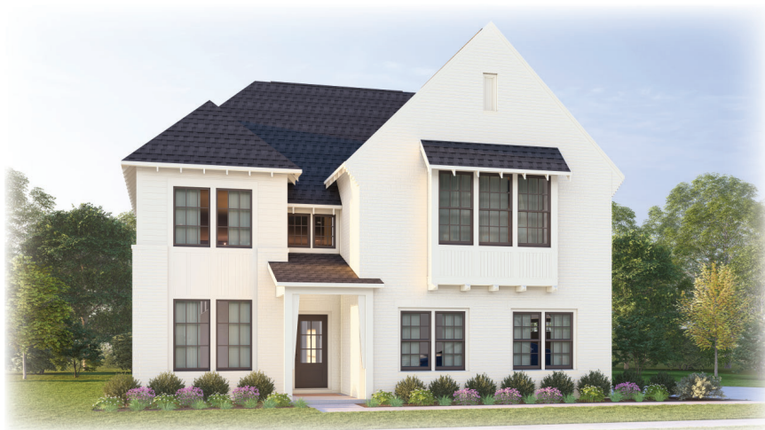
Elevation B - Side Load Garage