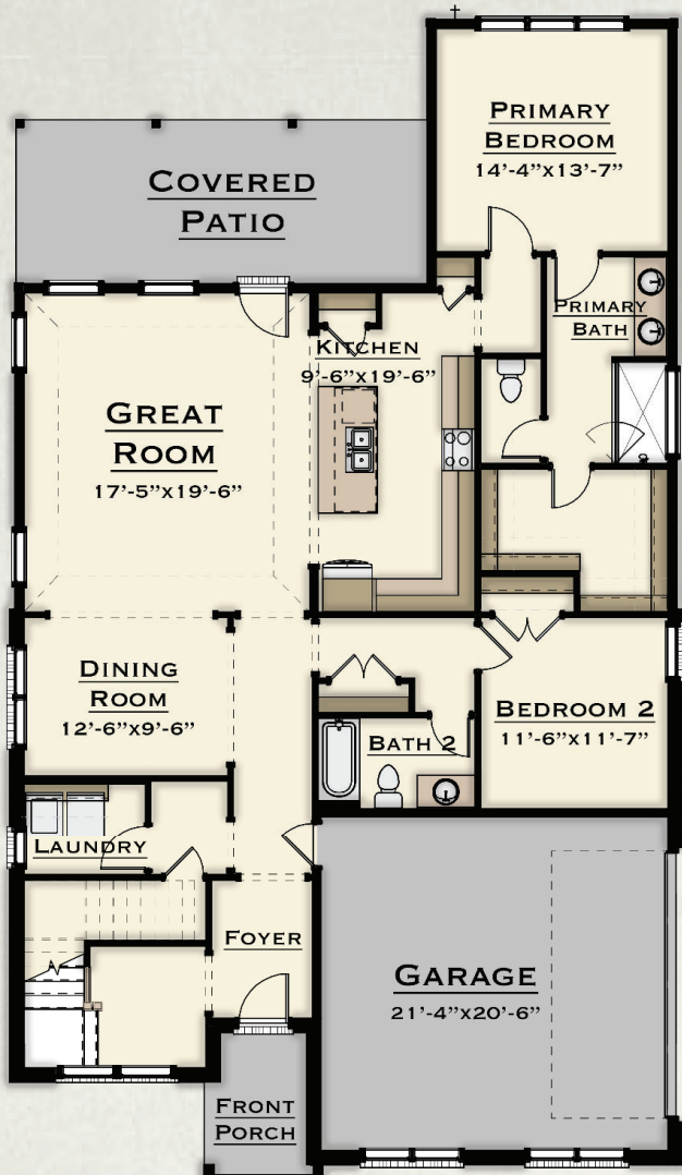
Main Level B