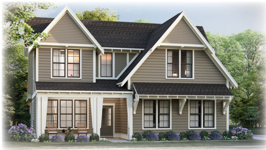
Elevation A - Side Load Garage