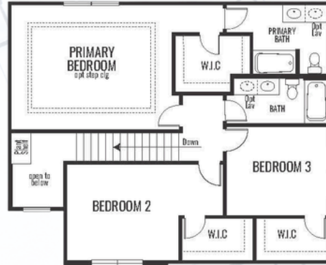
Three Bedroom Option