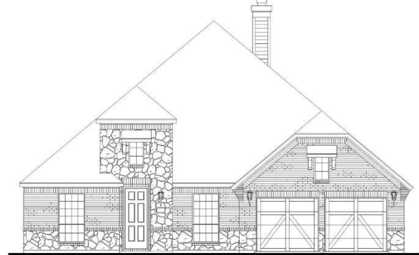
Elevation B with Stone