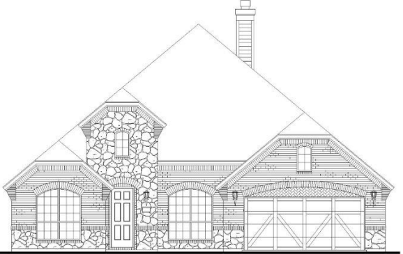
Elevation A with Stone