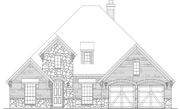
Elevation C with Stone

American Legend Homes reserves the right to change prices, plans, specifications, square footage and availability without prior notice or obligation. Square footages are approximate and may vary upon elevations and/or options selected. Elevations depicted are an artist's rendering and are subject to change or modification without notice. Not responsible for typographical errors. Please see a Sales Associate for more information. American Legend Homes and the ALH logo are registered trademarks of American Legend Homes, LLC. © 2020 American Legend Homes. All rights reserved.