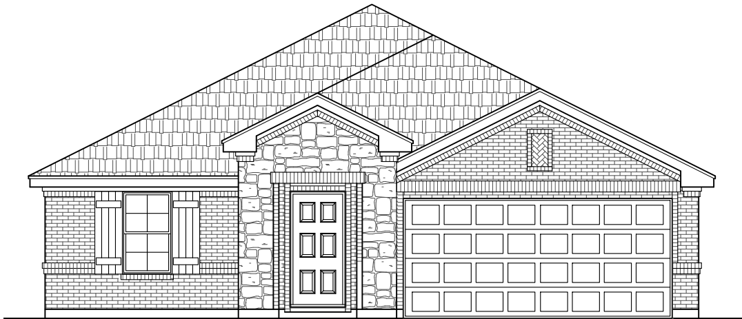
Elevation B (Opt. Stone &amp; Shutters shown)