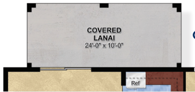
Optional Extended Covered Lanai (#00076)