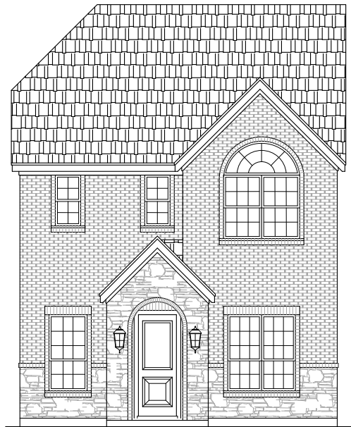
Elevation B (Opt. Stone Shown)