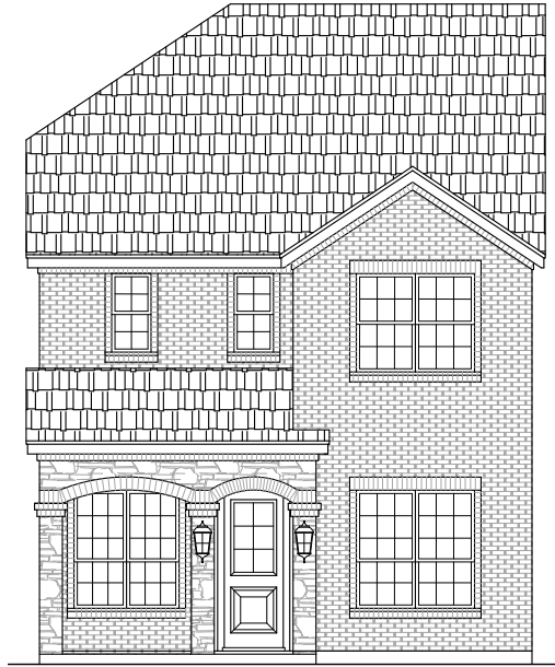
Elevation A (Opt. Stone Shown)