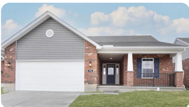
The Seabrook 3BR | 2BA | 1400 SF Affordable Luxury!