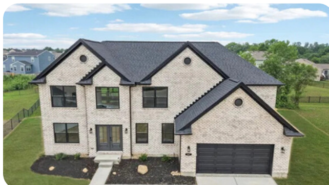
The Kingston 3+Loft or 4BR | 2.5 BA | 2531 SF 2 Story Great Room with Window Wall