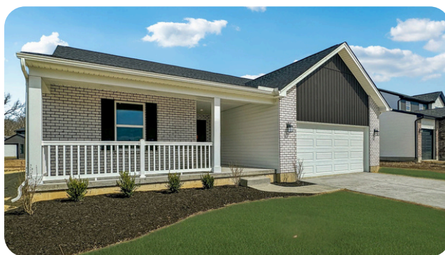
The Savannah 3BR | 2BA | 1652 SF Large Kitchen with Island