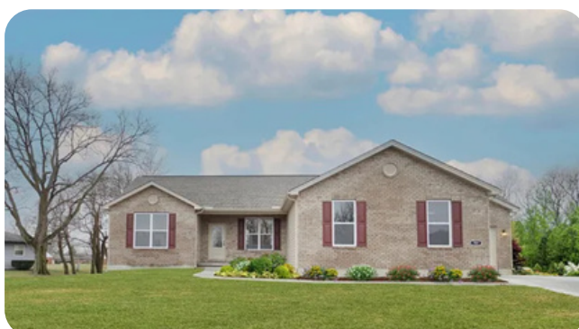
The Madison 3BR | 2BA | 1793 SF Traditional with a Twist