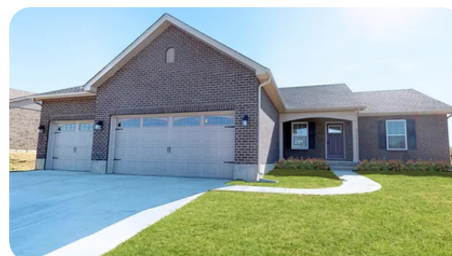
The Charleston 3BR | 2BA | 1665 SF *Shown with Optional 3 Car Garage