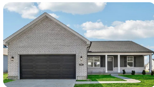
The Augusta 3BR | 2BA | 1752 SF One of Our Most Popular Plans