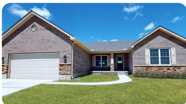
The Austin 3BR | 2BA | 1804 SF Flowing Floor Plan