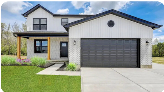
The Abbott 4BR | 2.5 BA | 1764 SF Open Concept