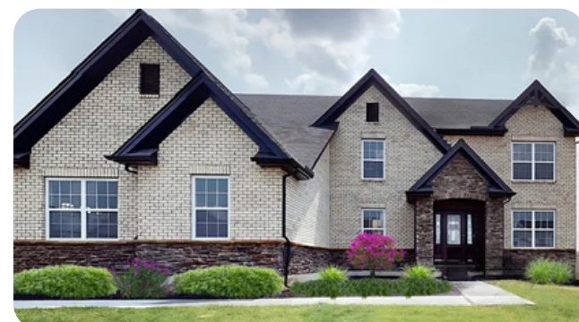
The Ambrose 4BR | 2.5BA | 3227 SF Elegant & Spacious