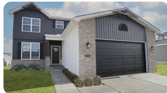
The Bayview 3/4BR | 2.5/3.5BA | 1911-1984 SF Versatile Floor Plan