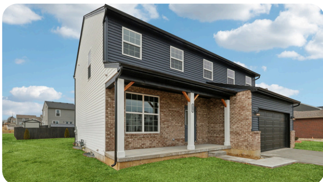
The Springfield 4BR | 2.5BA | 2120 SF Massive Primary Suite