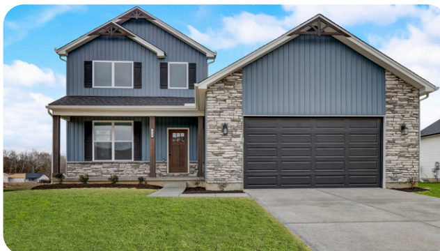
The Baybrook 3BR | 2.5BA | 1683 SF First Floor Primary Suite