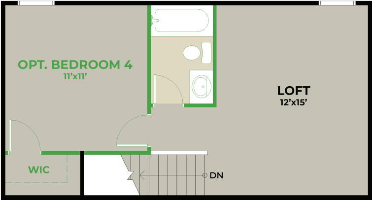
OPTIONAL BEDROOM & BATH

*Plan includes an unfinished powder/half bath on the first floor