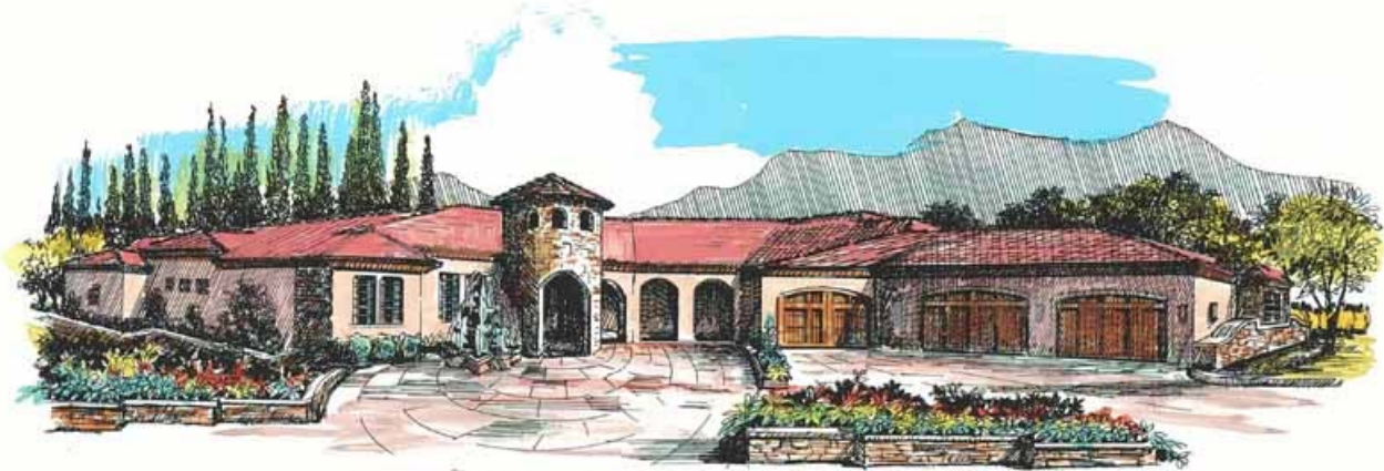
Weston Dean Homes