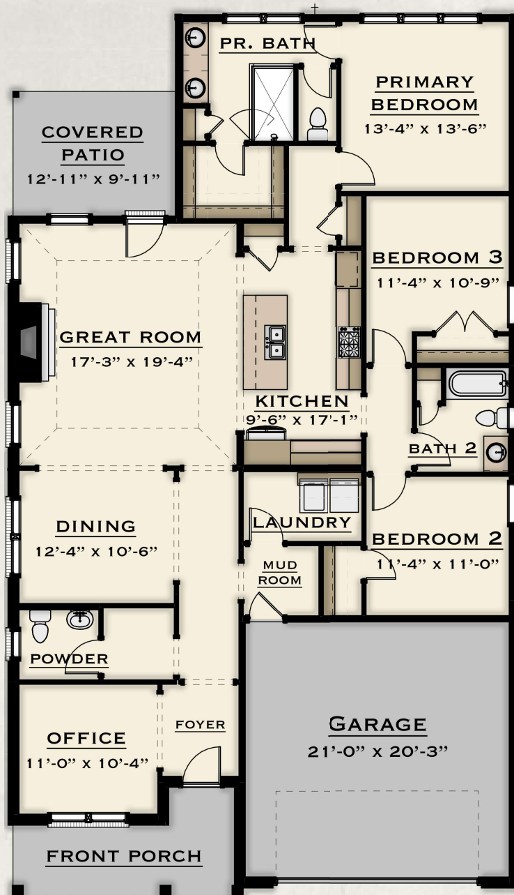
Main Level B