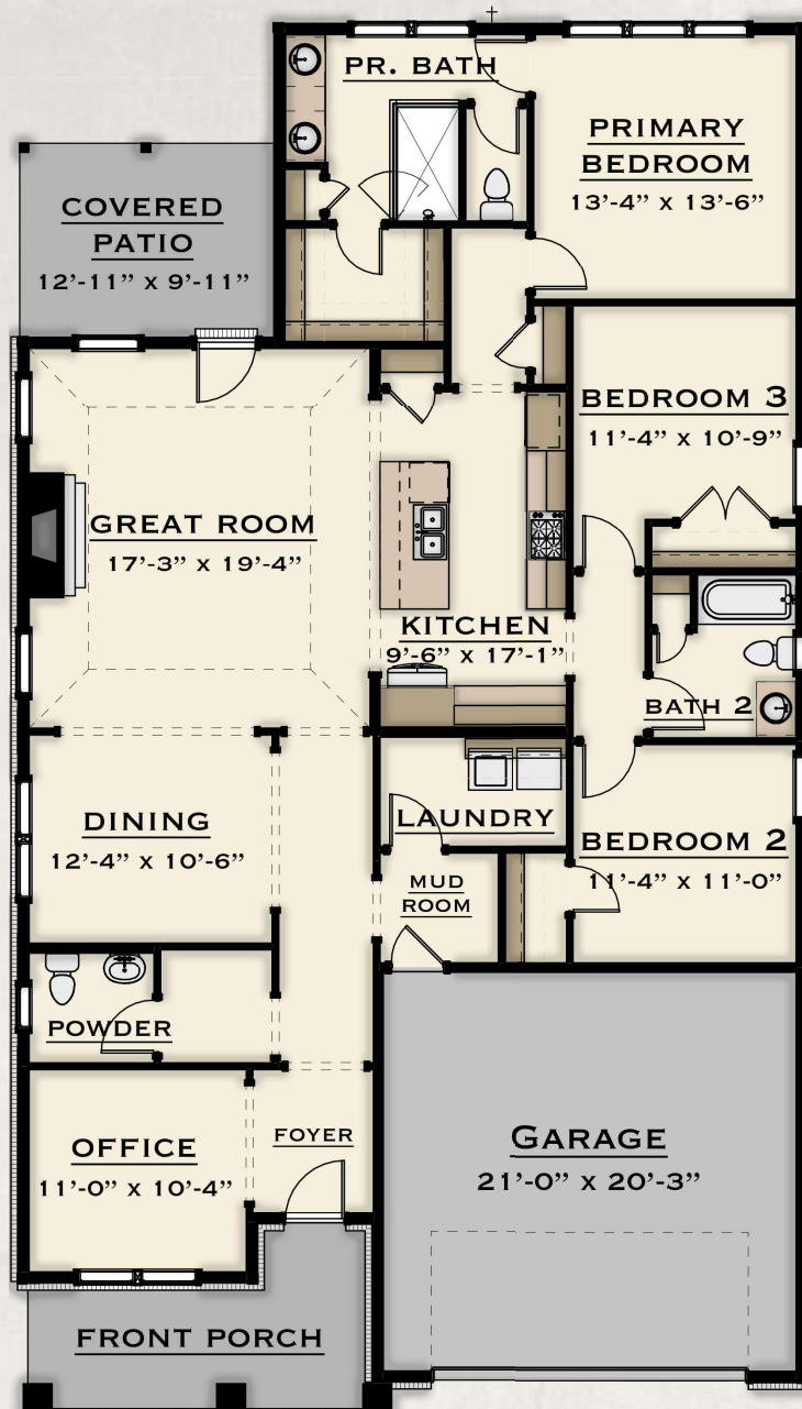
Main Level A