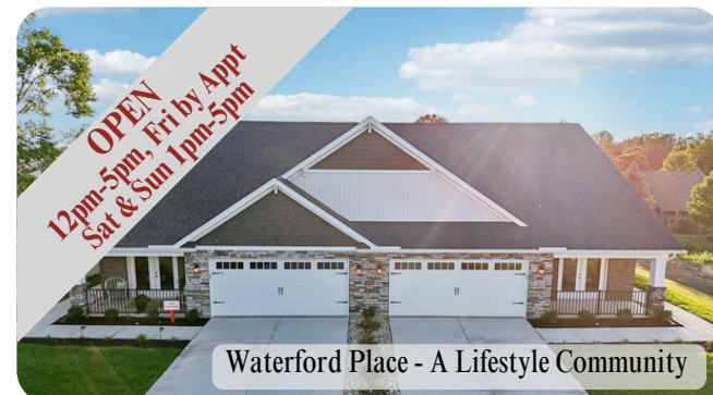
Model Home | 1900 Tipperary Drive | Middletown Tour Our Luxury Paired Villa Decorated Model! Quaint & Low Maintenance Community - No Cutting the Grass or Shoveling Snow. Enjoy Easy Living.

OPEN 12pm-5pm, Fri by Appt Sat & Sun 1pm-5pm