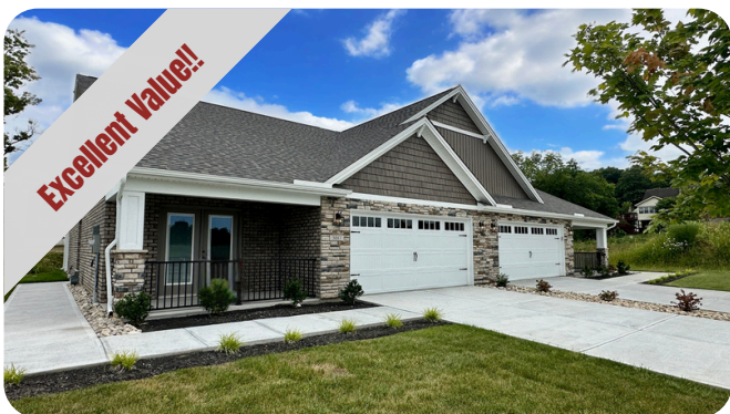
5017 Waterford Lane Upgraded Builder's Market Villa $359,000!