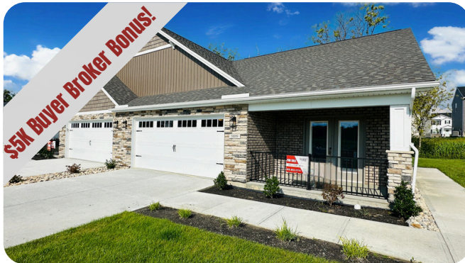
5019 Waterford Lane Upgraded Builder's Market Villa $369,000! Builder Rate Buy-Down