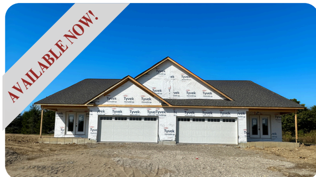
1924 Tipperary Dr. Luxury Villa with a Full Lower Level! Still Time to Choose Your Finishings!