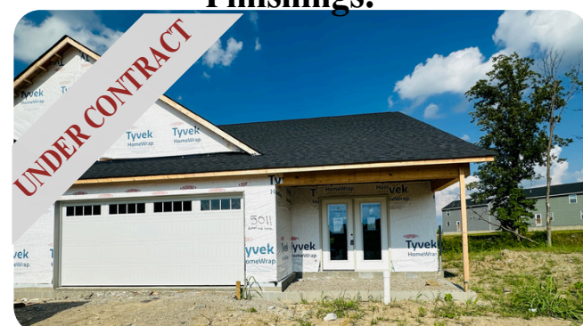
5011 Waterford Lane Time to Choose Your Finishings!