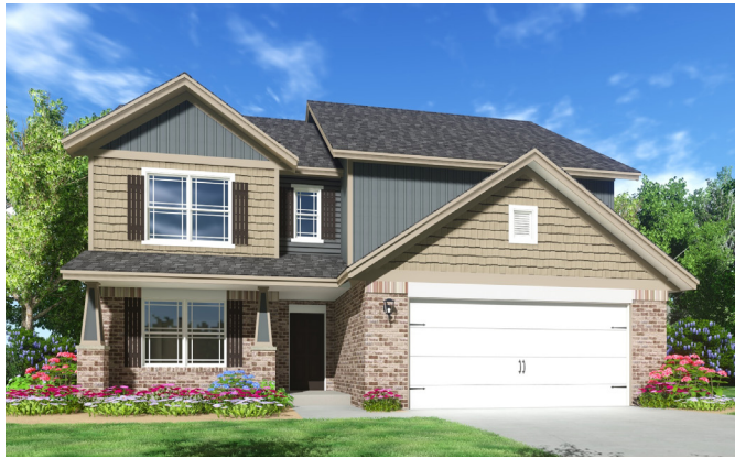
CRAFTSMAN SHOWN IN OPTIONAL 2-TONE PAINT, 2-TONE COLUMNS, ACCENT COLOR PRAIRIE GRIDS, & GARAGE DOOR HARDWARE