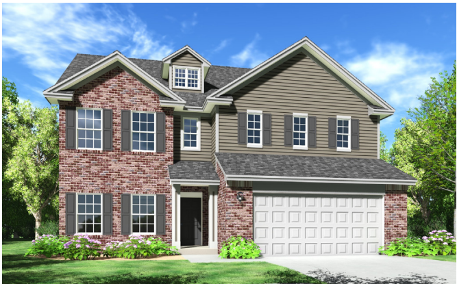
TRADITIONAL SHOWN WITH OPTIONAL 2-TONE PAINT & 2-TONE COLUMNS.