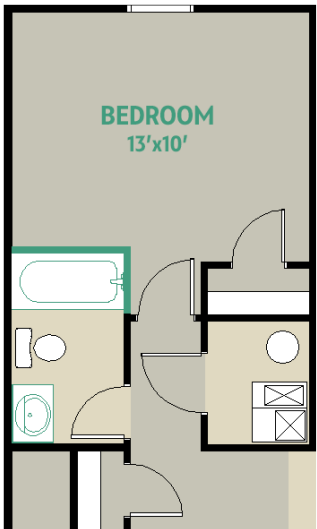
OPTIONAL BEDROOM AND FULL BATH IN PLACE OF DEN & POWDER