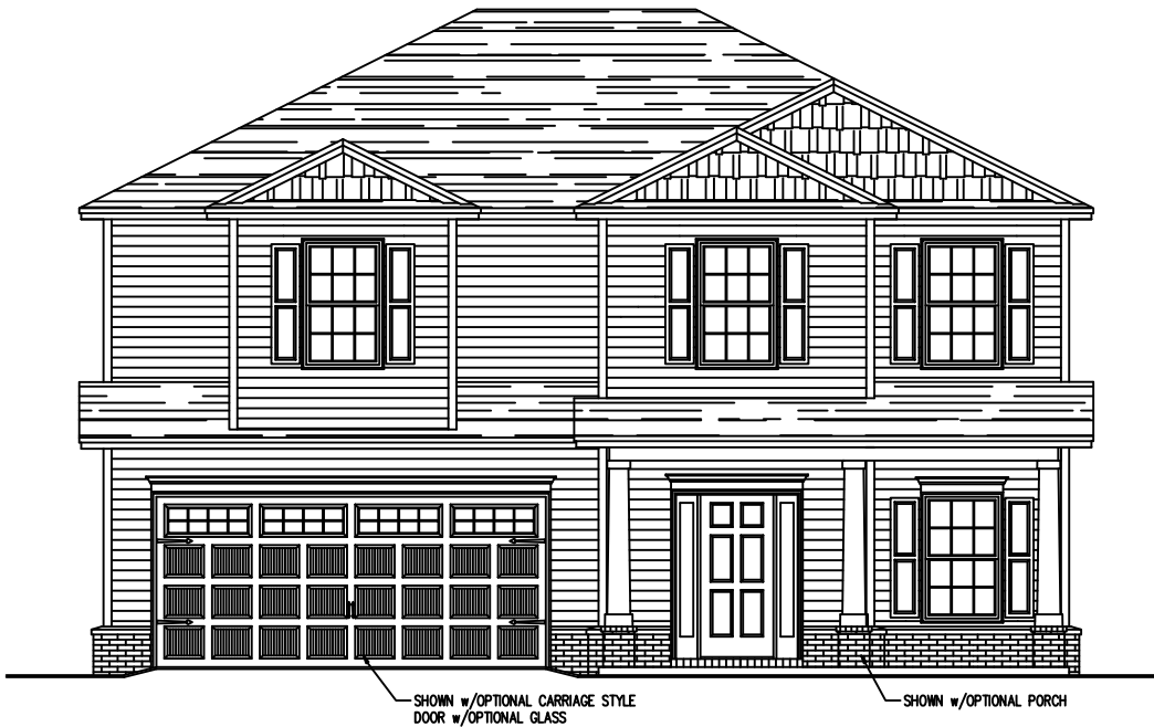
FRONT ELEVATION- B/B

NOTE: GARAGE ORIENTATION DEPENDS ON COMMUNITY STANDARDS. AN ADDITIONAL CHARGE WILL APPLY WITH A SIDE-ENTRY GARAGE THAT IS NOT NOTED AS AN "SG" PLAN.