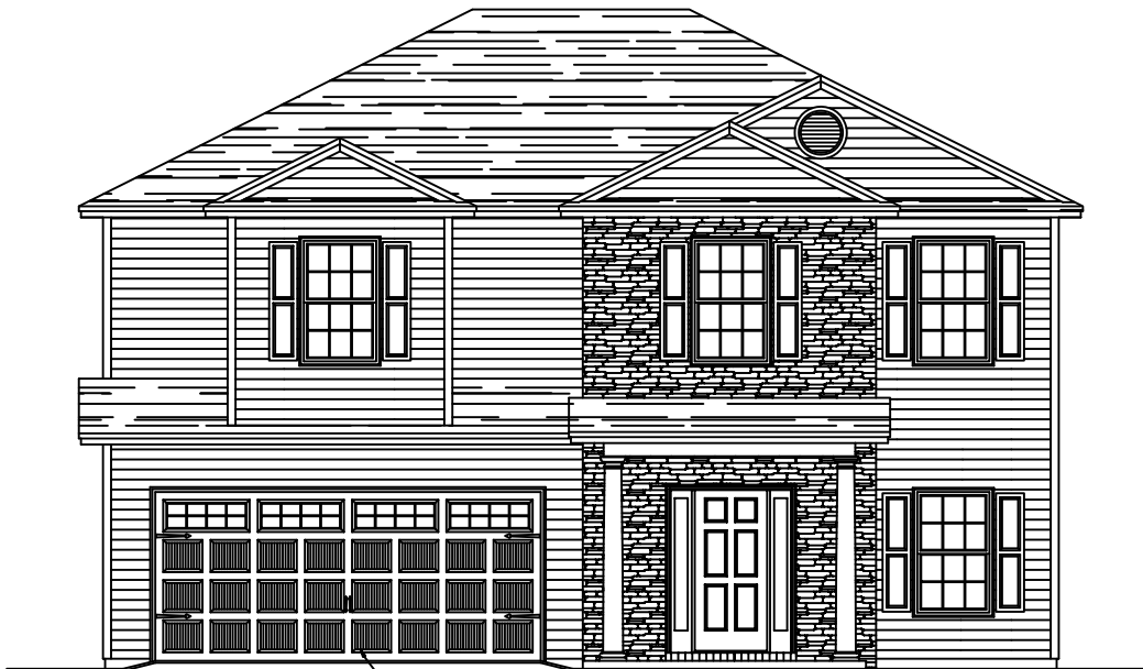
FRONT ELEVATION— B/C

— SHOWN w/OPTIONAL CARRIAGE STYLE DOOR w/OPTIONAL GLASS