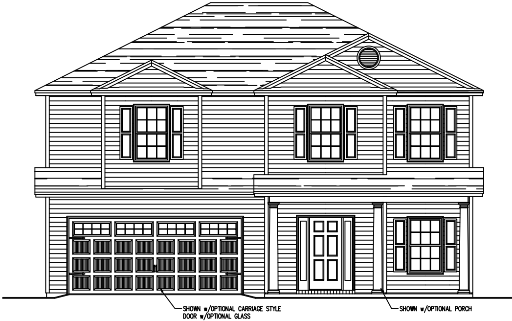
FRONT ELEVATION- B/A

HEATED: 2,520 SF UNDER ROOF: 2,966 SF DEPTH: 46'8" WIDTH: 39'8"