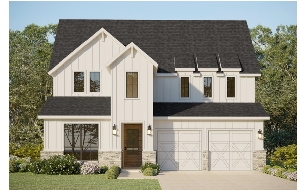
Elevation B with Stone