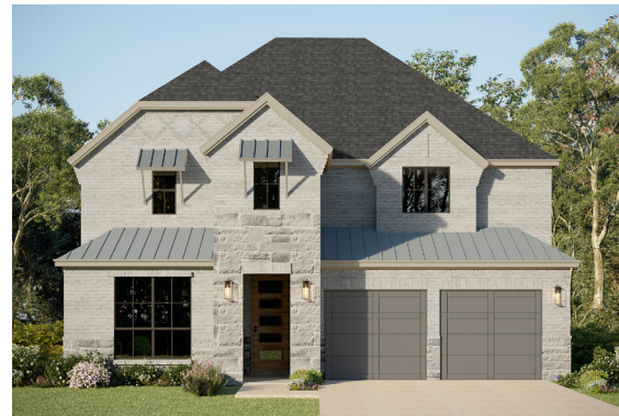
Elevation C with Stone

American Legend Homes reserves the right to change prices, plans, specifications, square footage and availability without prior notice or obligation. Square footages are approximate and may vary upon elevations and/or options selected. Elevations depicted are an artist's rendering and are subject to change or modification without notice. Not responsible for typographical errors. Please see a Sales Associate for more information. American Legend Homes and the ALH logo are registered trademarks of American Legend Homes, LLC. © 2026 American Legend Homes. All rights reserved. Plan 1569.ABC_05/29/26