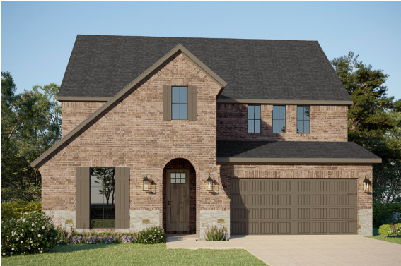
Elevation A with Stone