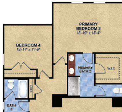
Optional Second Primary Bedroom (#00022)