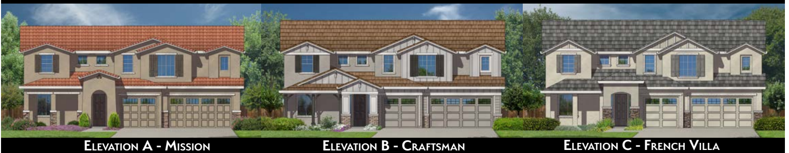
ELEVATION A - MISSION