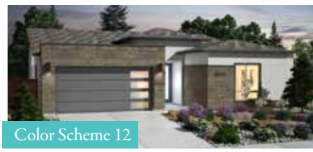
Color Scheme 12