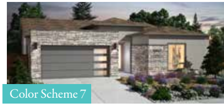
Color Scheme 7