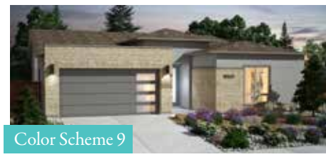
Color Scheme 9