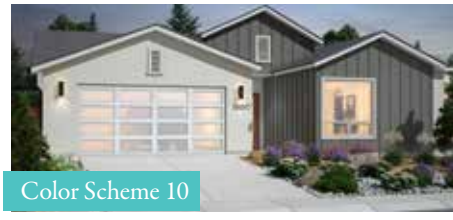
Color Scheme 10