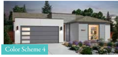
Color Scheme 4