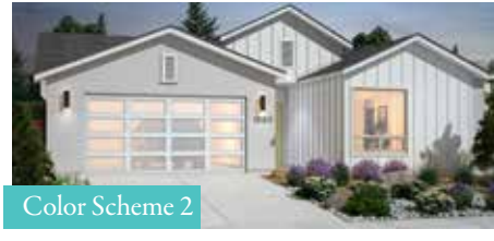
Color Scheme 2