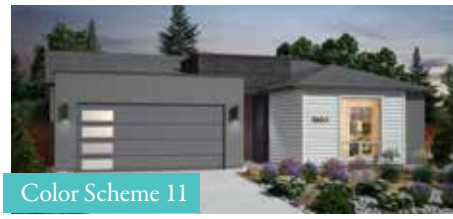
Color Scheme 11