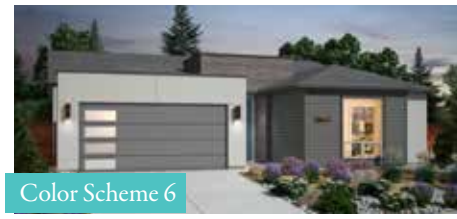
Color Scheme 6