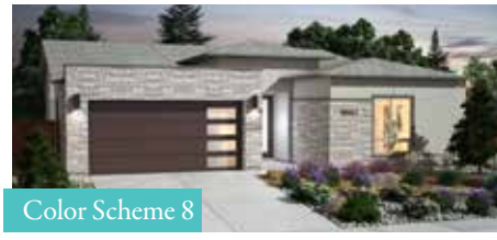
Color Scheme 8