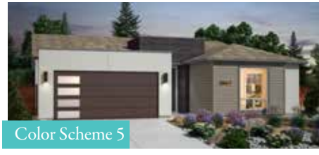
Color Scheme 5