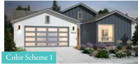
Color Scheme 1