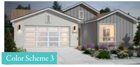
Color Scheme 3