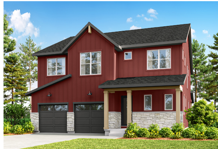
ELEVATION A (FARMHOUSE)

2,975 Sq. Ft. Finished Above Ground 978 Sq. Ft. Unfinished Basement 4-6 Bedrooms 3.5-4.5 Bathrooms 3 Car Garage