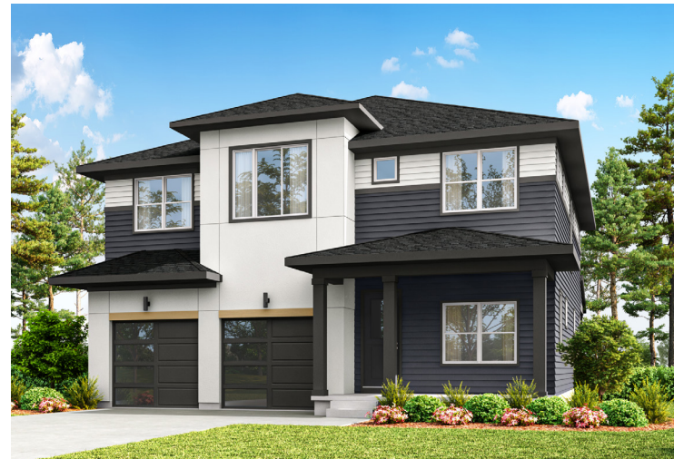
ELEVATION B (CONTEMPORARY)