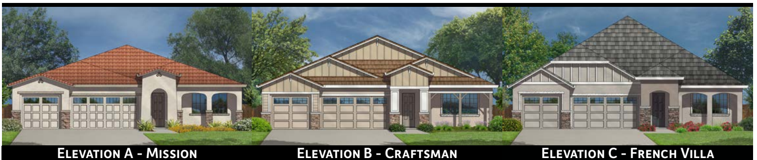
ELEVATION A - MISSION