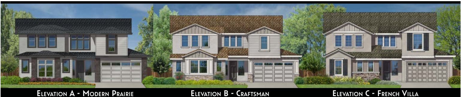
ELEVATION A - MODERN PRAIRIE