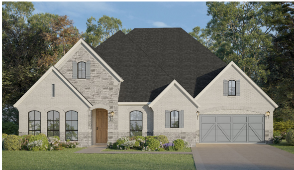
Elevation A with Stone