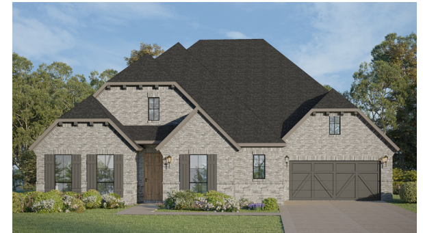
Elevation B with Stone