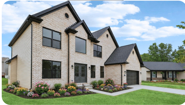
The Kingston 3+Loft or 4BR | 2.5 BA | 2531 SF 2 Story Great Room with Window Wall