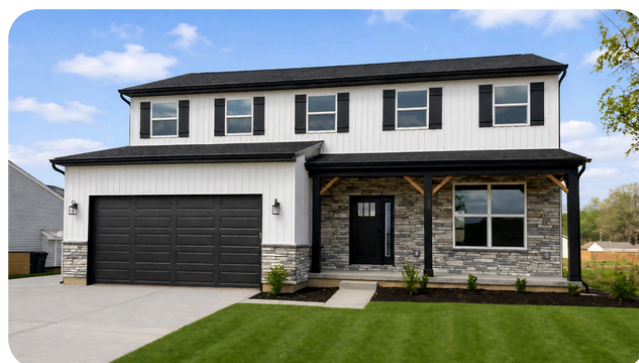
The Springfield 4BR | 2.5BA | 2120 SF Massive Primary Suite