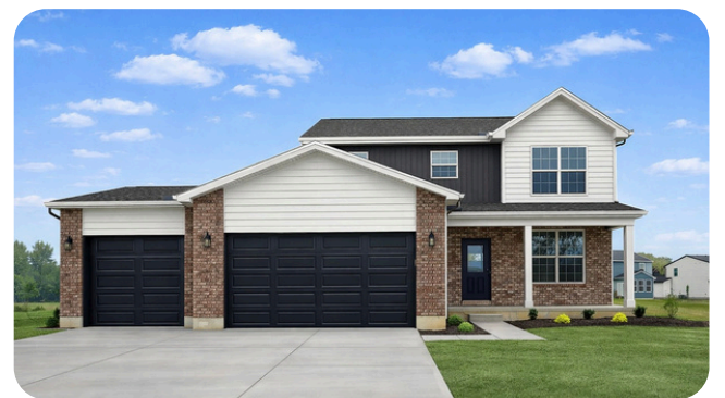
The Bayview 3/4BR | 2.5/3.5BA | 1911-1984 SF Versatile Floor Plan