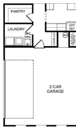
2-CAR SIDE ENTRY GARAGE