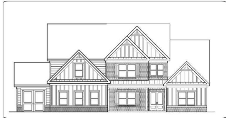
3-CAR SIDE ENTRY GARAGE