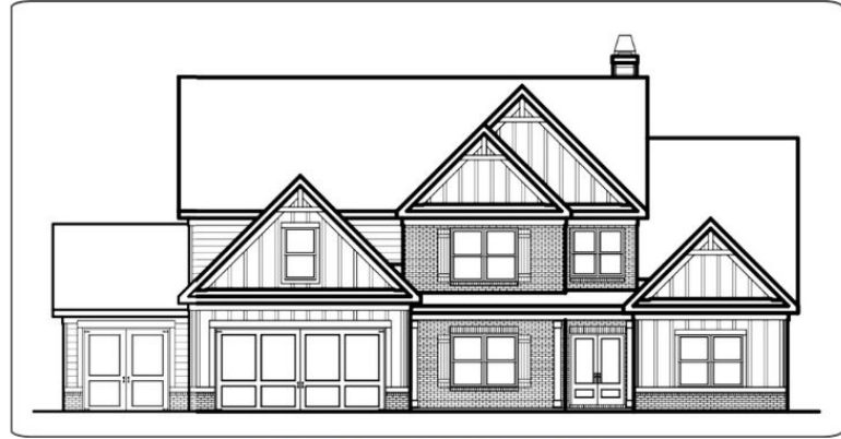
3-CAR FRONT ENTRY GARAGE