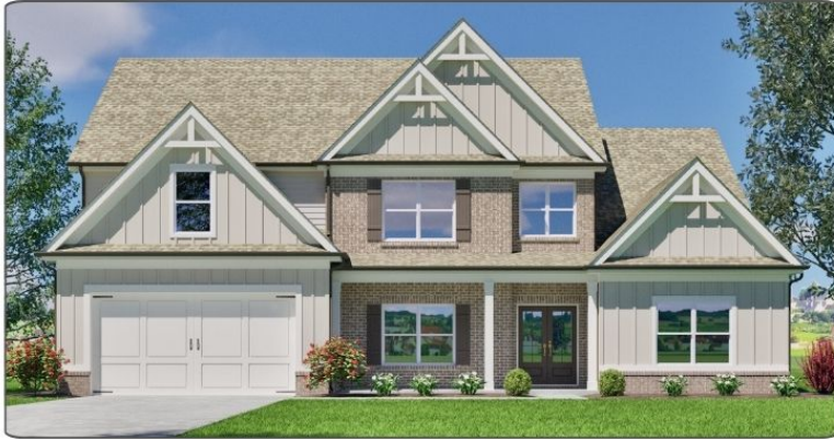
2-CAR FRONT ENTRY GARAGE

TWO-STORY | 5 BEDROOMS | 4 BATHROOMS | 3,429 SQ FT | ELEVATION A