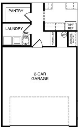
2-CAR FRONT ENTRY GARAGE