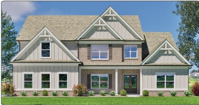
2-CAR SIDE ENTRY GARAGE