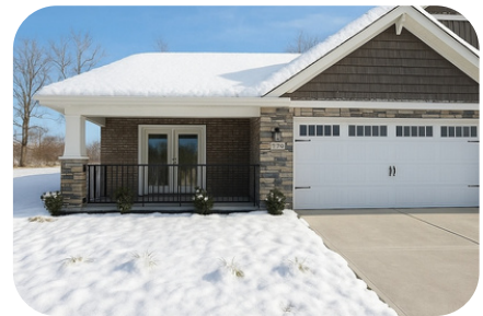
5017 Waterford Lane