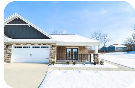
5019 Waterford Lane