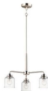
Lighting: Maxim Acadia Collection Vibrant Stainless