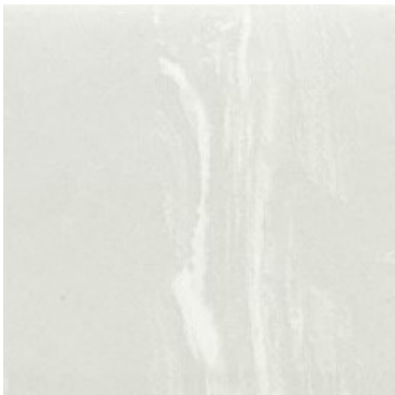
Bathroom Countertops: Molded Marble- White on White