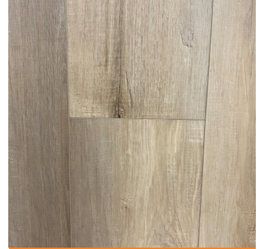
Flooring: Inspired LVP- Napa