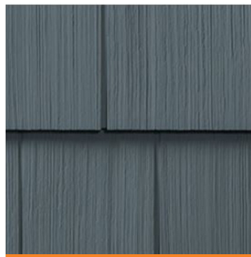
Shake Siding: Pacific Blue