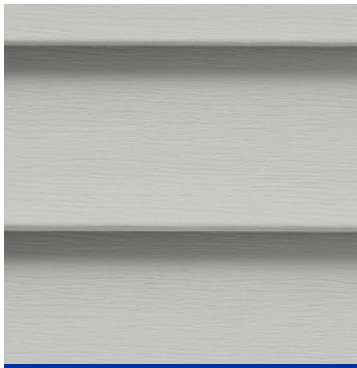
Siding: Sterling Gray