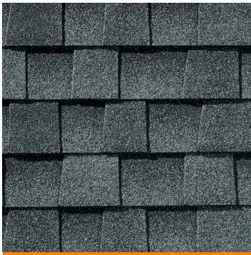
Roof Shingles: Pewter Gray