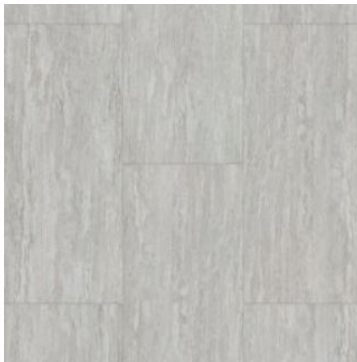
Bathroom Flooring: Mari Tavertine