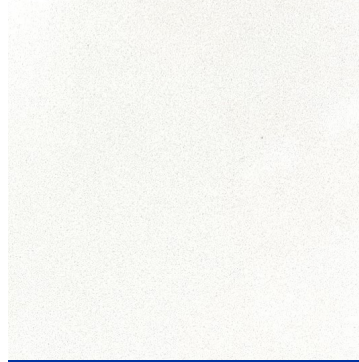
Kitchen Countertops: Quartz - Frost White