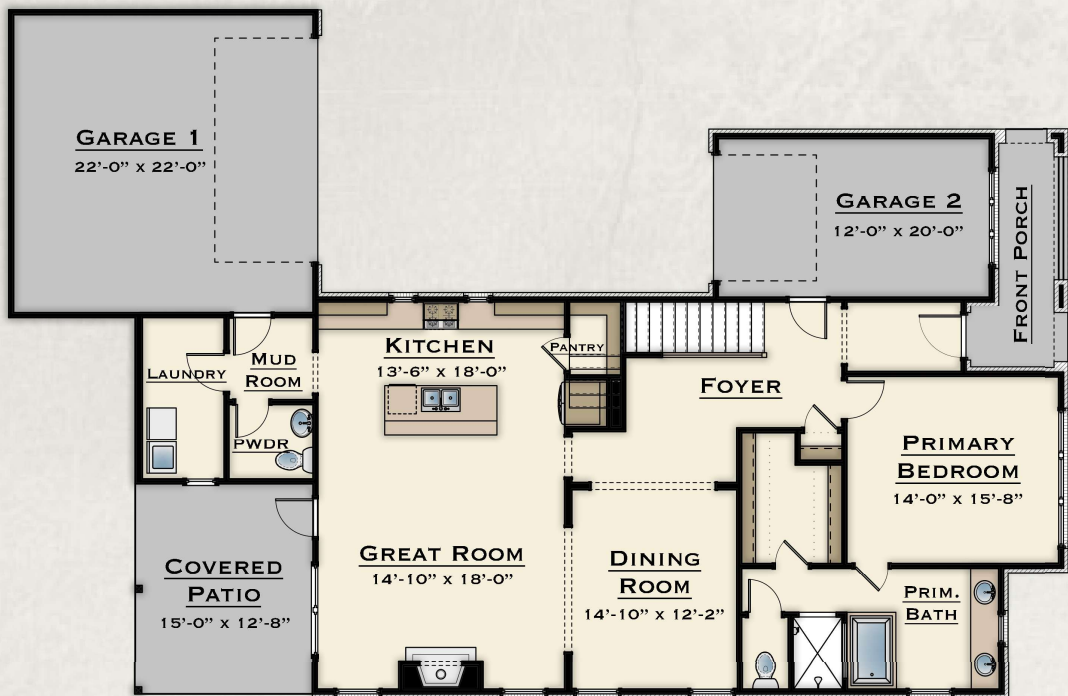
Main Level A