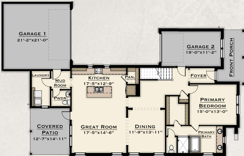
Main Level B