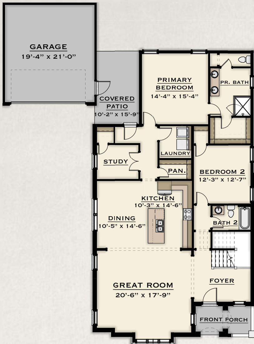
Main Level A