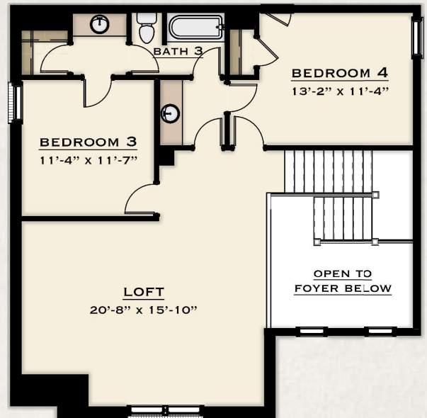
Second Floor B