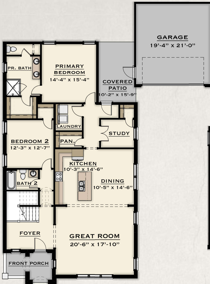
Main Level C