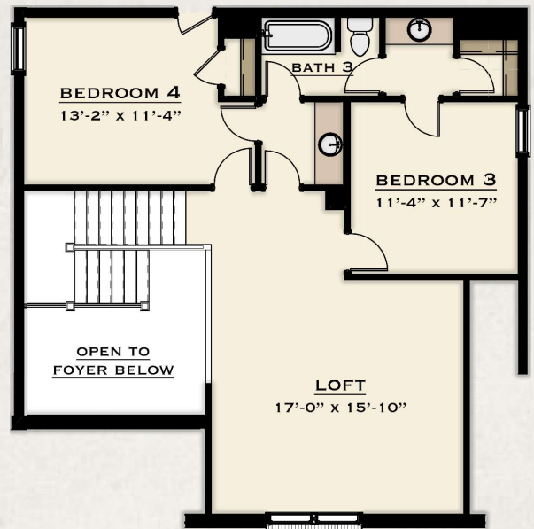
Second Floor C