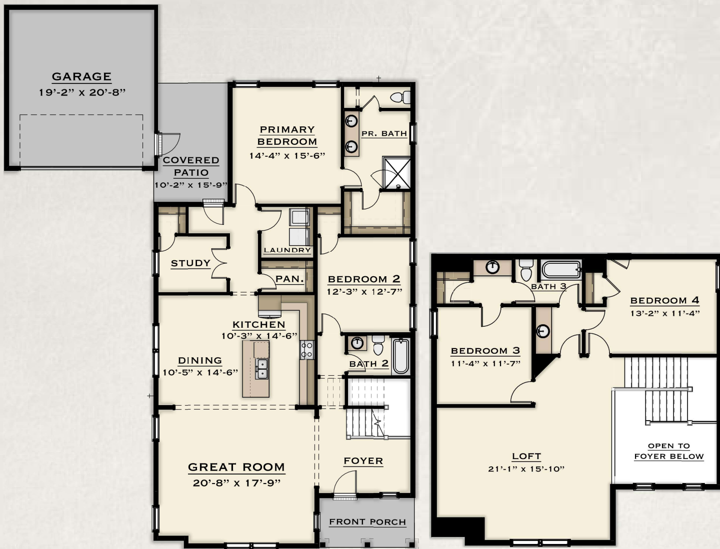
Main Level E