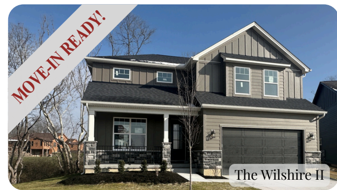
The Wilshire II