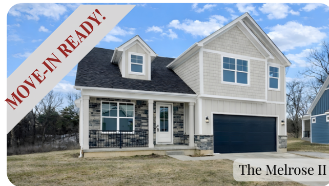
The Melrose II