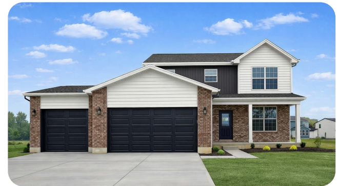
The Bayview 3/4BR | 2.5/3.5BA | 1911-1984 SF Versatile Floor Plan