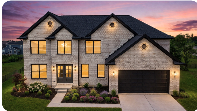
The Kingston 3+Loft or 4BR | 2.5 BA | 2531 SF 2 Story Great Room with Window Wall