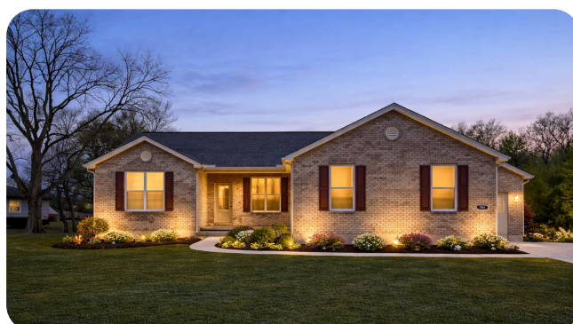
The Madison 3BR | 2BA | 1793 SF Traditional with a Twist