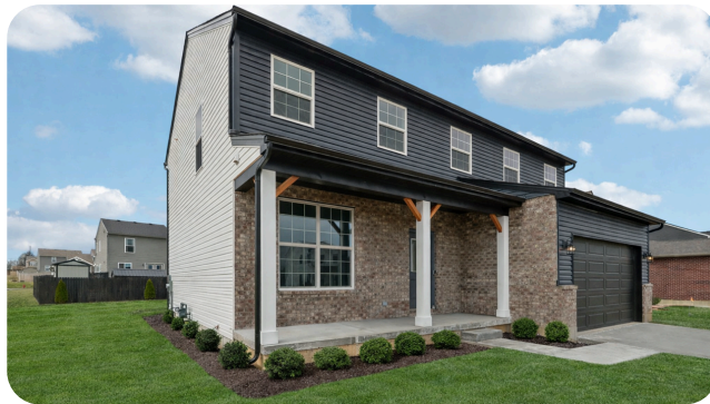
The Springfield 4BR | 2.5BA | 2120 SF Massive Primary Suite