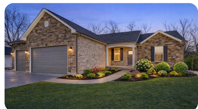
The Charleston 3BR | 2BA | 1665 SF *Shown with Optional 3 Car Garage

Options Available Include a 3 Car Garage on Select Designs & Homesites