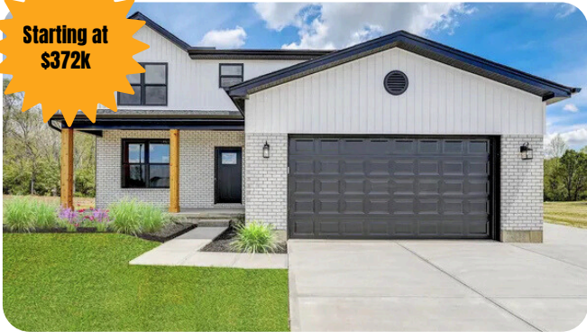
The Abbott 4BR | 2.5 BA | 1764 SF Open Concept