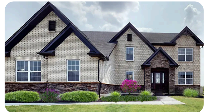
The Ambrose 4BR | 2.5BA | 3227 SF Elegant & Spacious