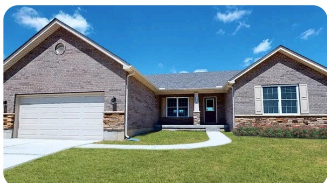
The Austin 3BR | 2BA | 1804 SF Flowing Floor Plan