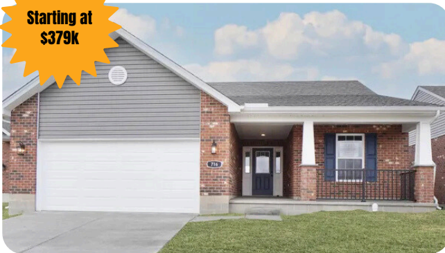
The Seabrook 3BR | 2BA | 1400-1507 SF Affordable Luxury!