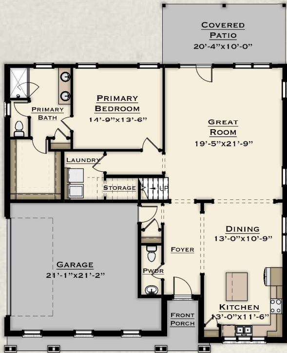
Main Level A