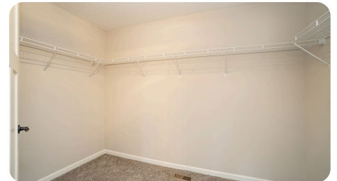
The Savannah