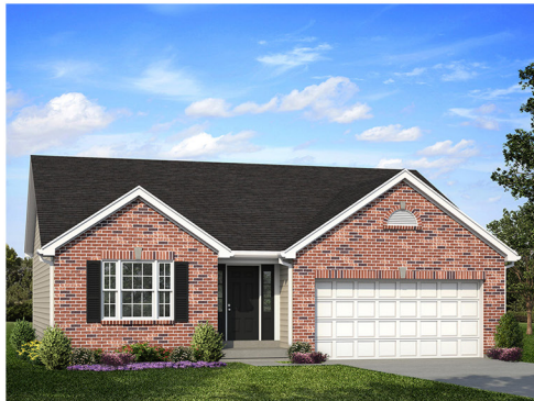
ENGLISH COLONIAL III