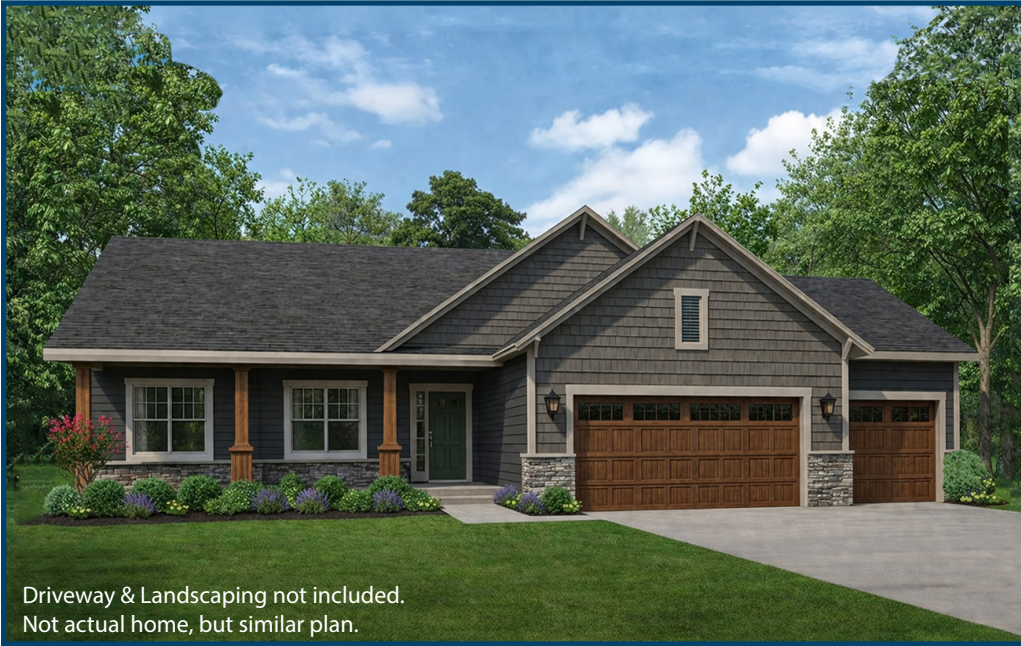
Driveway & Landscaping not included. Not actual home, but similar plan.