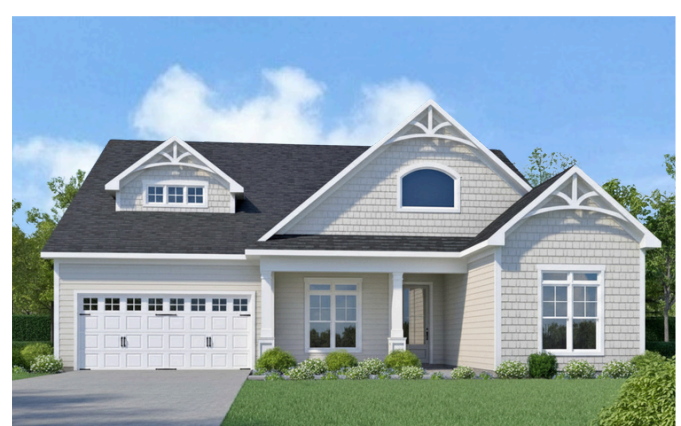
Optional Elevation D4