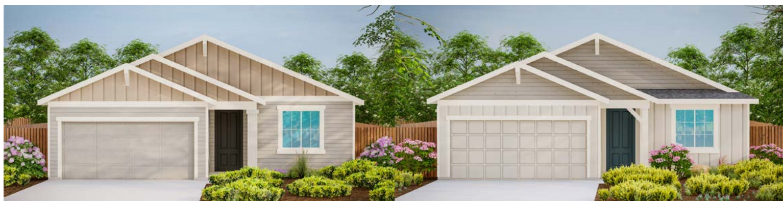
ELEVATION A - FARMHOUSE