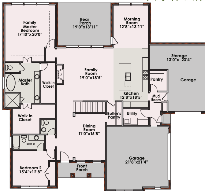
Main Level Floor 2,477 sf