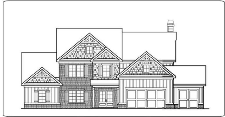
3-CAR FRONT ENTRY GARAGE