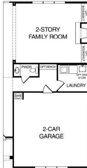
2-CAR SIDE ENTRY GARAGE