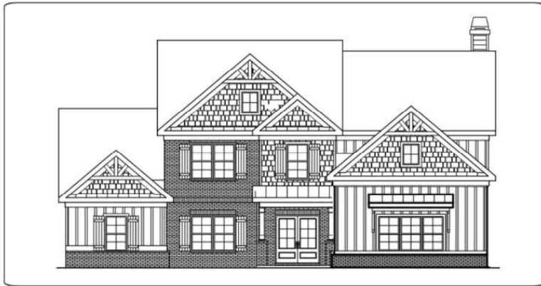
2-CAR SIDE ENTRY GARAGE