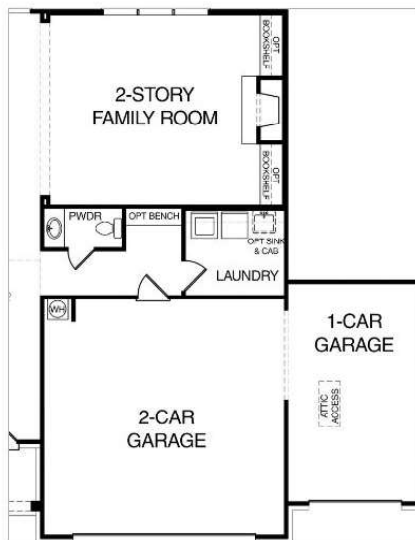
3-CAR FRONT ENTRY GARAGE