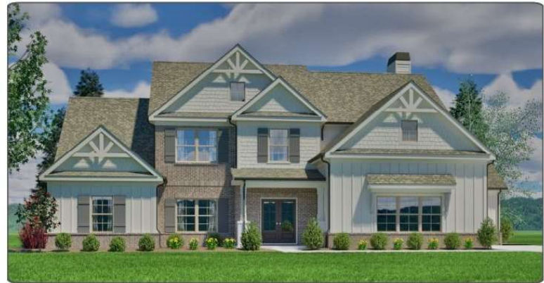
3-CAR SIDE ENTRY GARAGE