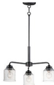
Lighting: Maxim Acadia Collection Matte Black