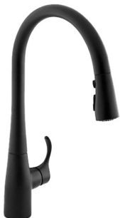
Kitchen Plumbing: Kohler Simplice Black

Home elevation renderings and color selection sample images are for illustration purpose only. Digital representation of colors may vary from the actual product. Price accurate as of 07/25/2025. Builder reserves the right to make changes without notice.