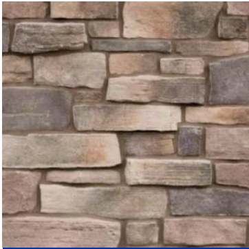
Fireplace Masonry: Winona Weatheredge