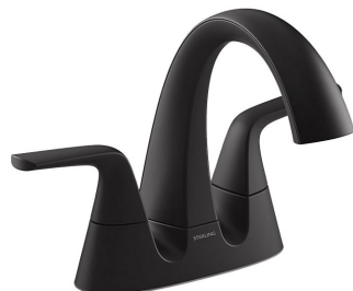
Bathroom Plumbing: Kohler Simplice Black