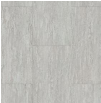
Bathroom Flooring: LVT- Mari Tavertine