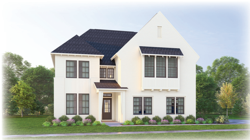
Elevation B - Side Load Garage