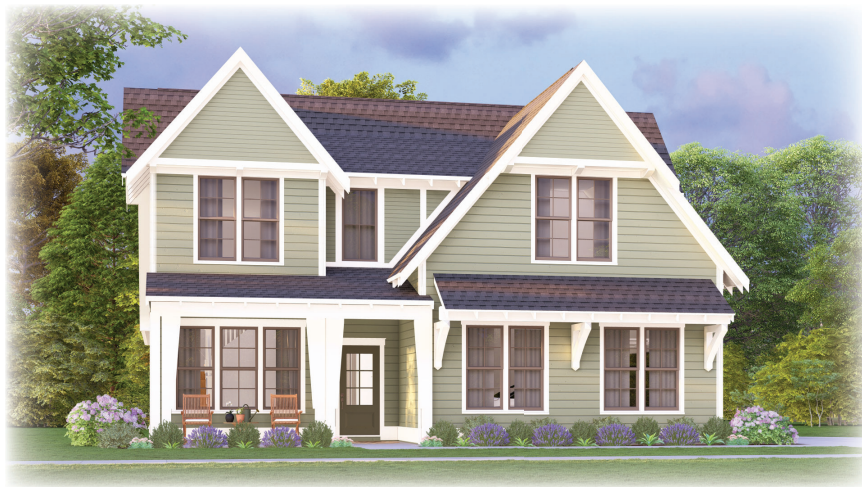
Elevation A - Side Load Garage