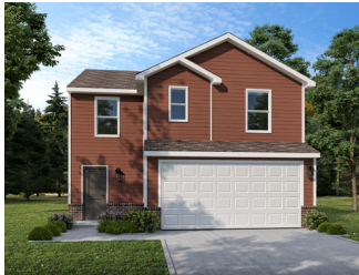
SHOWN WITH BRICK OPTION A