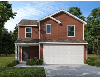
SHOWN WITH EXTERIOR PORCH