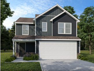
SHOWN WITH BRICK OPTION A