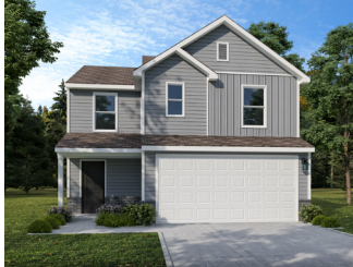
SHOWN WITH BRICK OPTION A