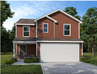
SHOWN WITH EXTERIOR PORCH AND BRICK OPTION A