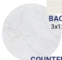
BACKSPLASH 3x12 Flow White