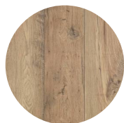
REVWOOD SELECT Foyer, Dining Room, Kitchen/Pantry, Family Room, First Floor Halls, Mudroom Area off Garage, Primary Suite/Closet Color: Fawn Chestnut