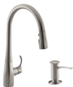
KITCHEN FAUCET: Kohler Simplice Pull-Down Matte Black