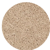
CARPET (8 LB PAD) Bedroom #2/Closet, Bedroom #3/Closet, Bedroom #4/Closet, Stairs/Landing Color: Cross Country