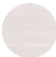
FLOOR TILE Adrock 12x24 Frost Natural