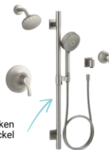
PLUMBING Kohler Simplice Brushed Nickel