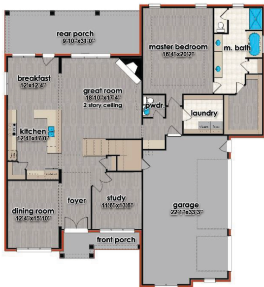
Main Level Floor