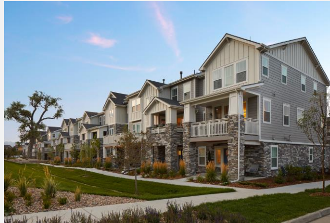
DUPLEXES & TOWNHOMES