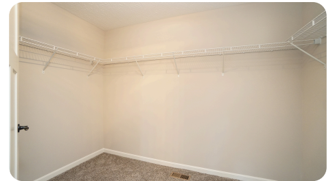
The Savannah by Todd Homes