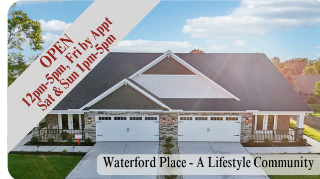
Waterford Place - A Lifestyle Community

OPEN 12pm-5pm, Fri by Appt Sat & Sun 1pm-5pm