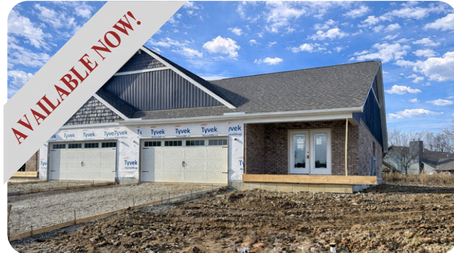
1924 Tipperary Dr. Luxury Villa with a Full Lower Level! Still Time to Choose Your Finishings!