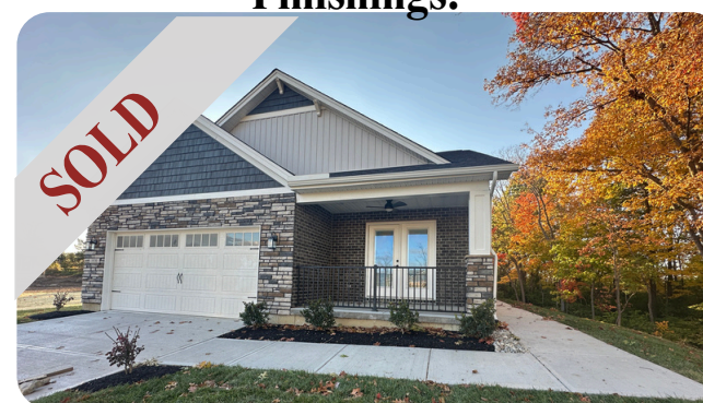
1930 Tipperary Drive Custom Single Villa Built-to-Suit