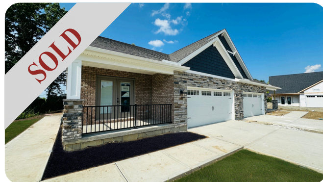
5005 Waterford Lane Custom Villa with Full Lower Level