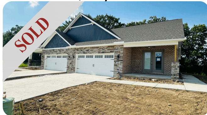
5007 Waterford Lane Custom Villa with Full Lower Level