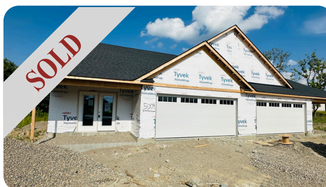
5009 Waterford Lane Custom Villa