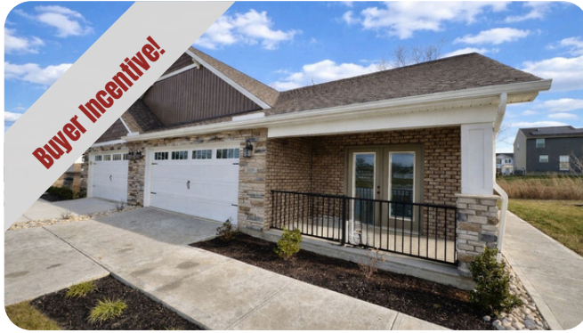
5019 Waterford Lane Upgraded Builder's Market Villa $368,900!