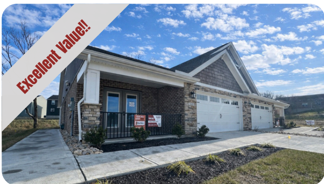
5017 Waterford Lane Upgraded Builder's Market Villa $358,900!