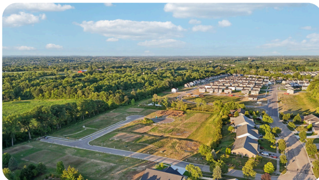
Lifestyle Community Easy Living - Low HOA

OPEN 12pm-5pm, Fri by Appt Sat & Sun 1pm-5pm