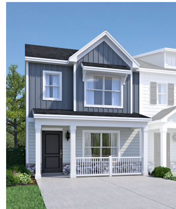
ELEVATION G End