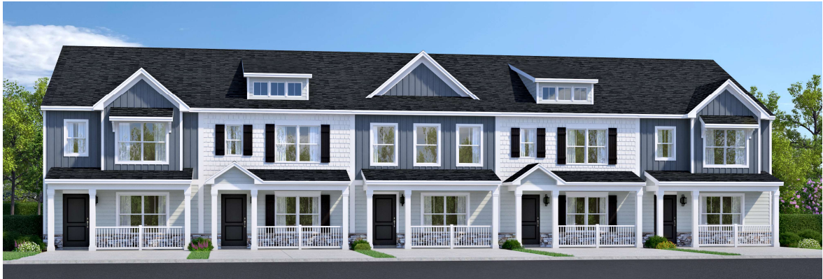
5 Plex Elevation