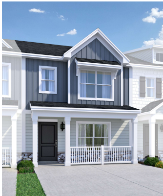
ELEVATION G Interior