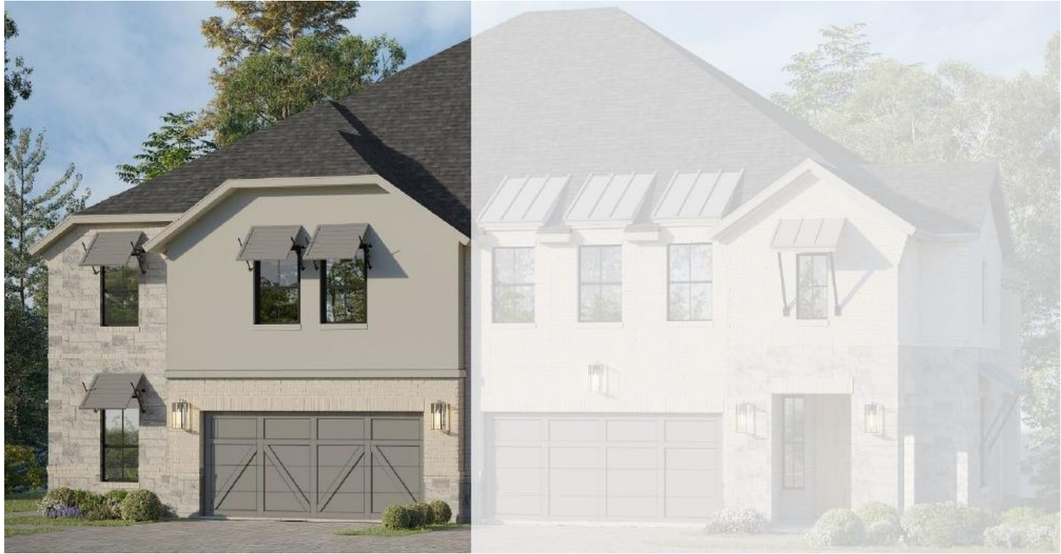
Villas at Mustang Lakes 3305 Jazil Street