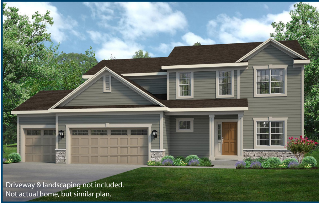
Driveway & landscaping not included. Not actual home, but similar plan.